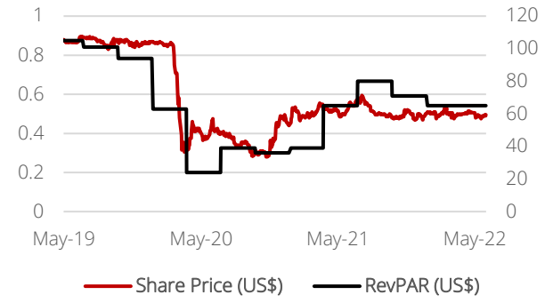
ARAHT RevPAR (US$) vs Share Price (US$)

ARAHT gearing sensitivity with divestment proceeds used to reduce debt (US$m)